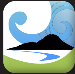
The Eastern Bay App