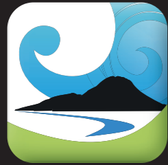
The Eastern Bay App