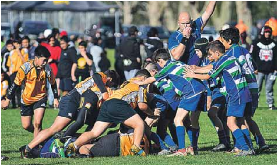
>SPORT New Zealand is taking a look at the integrity of grassroots sport.